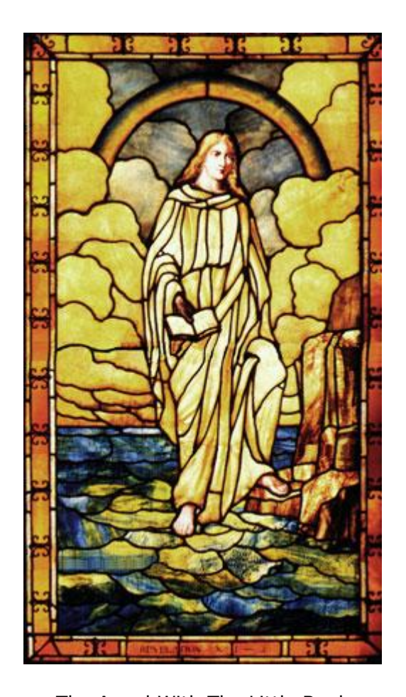
The Angel With The Little Book Science and Health