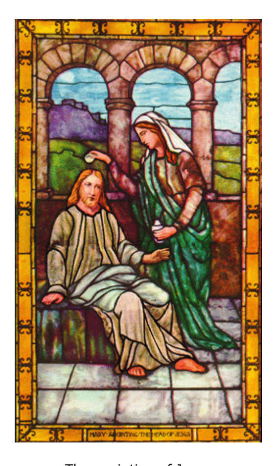
The anointing of Jesus