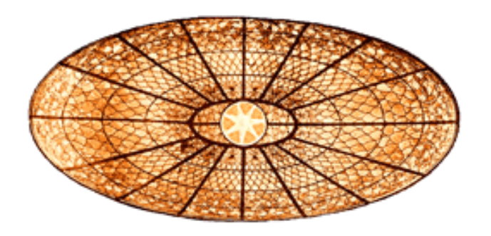
THE SUNBURST The Christian Science Journal Vol. 12