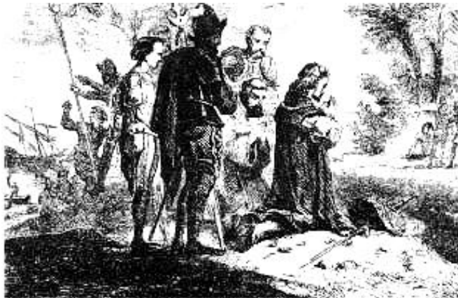
Christopher Columbus kneels in prayer upon landing at San Salvadore, now known as Watling Island, in the Bahamas. 1992 represented the 500th anniversary of the discovery of the new world.

Christopher Columbus's voyage had opened the door to America spiritually as well as geographically.