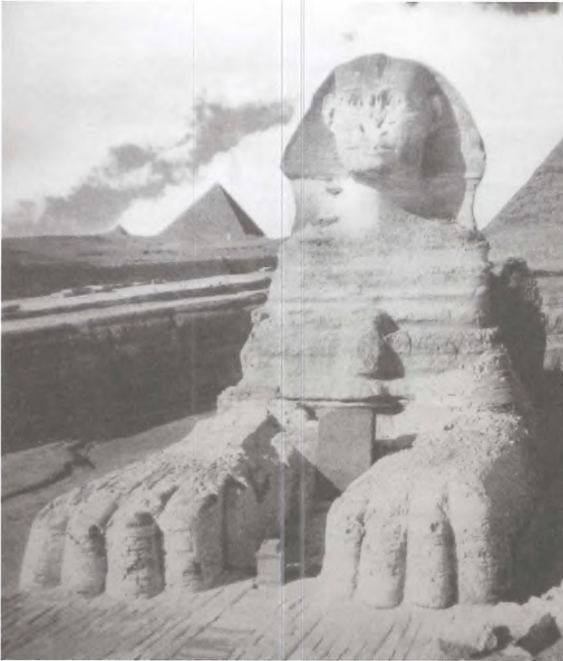
THE GREAT SPHINX