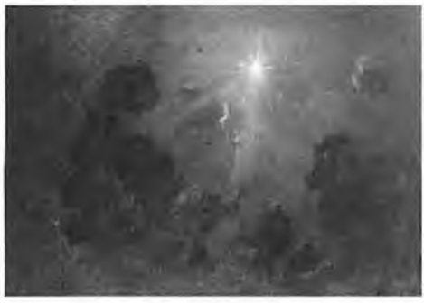
STAR OF BETHLEHEM.

But the world was more interested in the flesh than in the Spirit, so God's Chosen Witness had to add much about human ancestry to satisfy the worldly questions. About the time that she was doing this that she might reach human thought, she also wrote her spiritual biography in a poem of fifteen stanzas. Have you ever analyzed that poem as her spiritual biography?