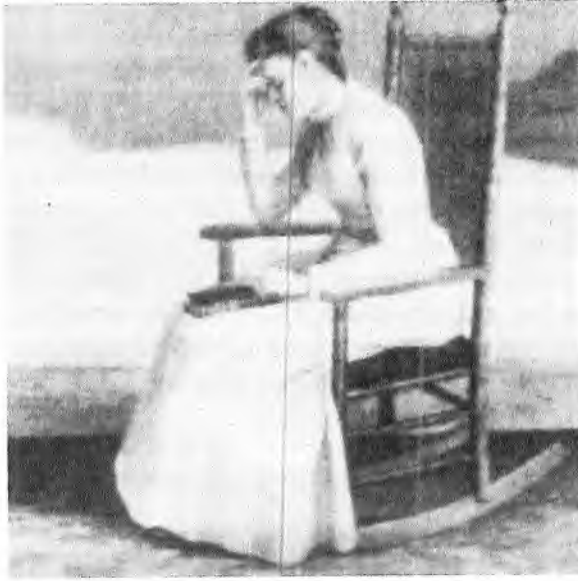
From the Eighth Picture in Christ and Christmas