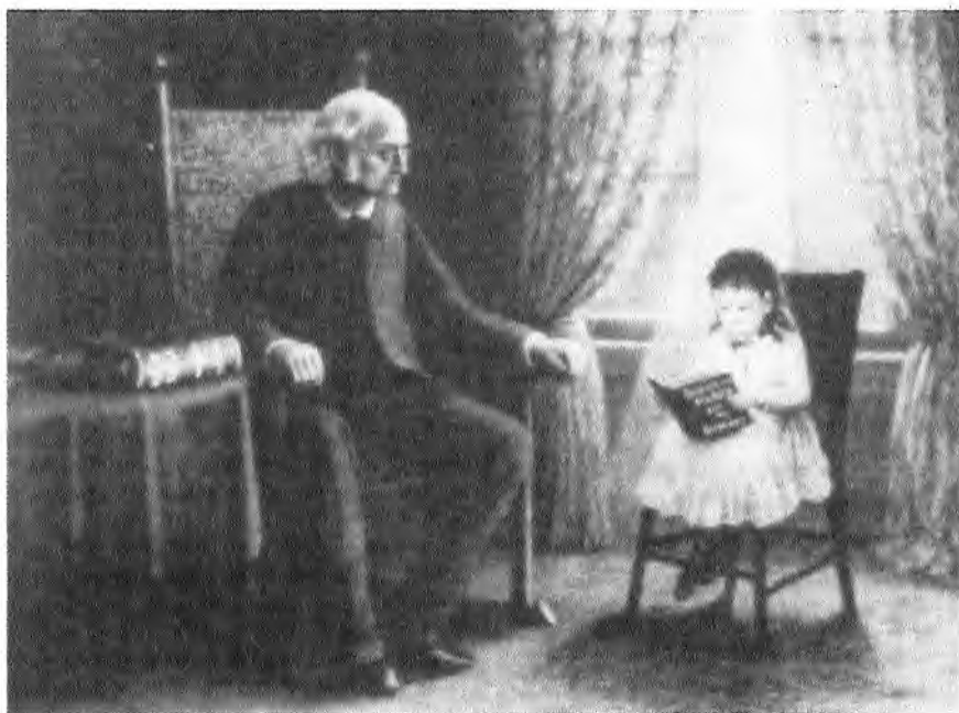
Seventh Picture in Christ and Christmas

In picture 7 the man appears aged, but not so decrepit as the grandmother. His clothing is a little lighter, entering the second degree, evil beliefs disappearing (S&H 115). But notice he, too, is holding fast to the chair or mortal belief.