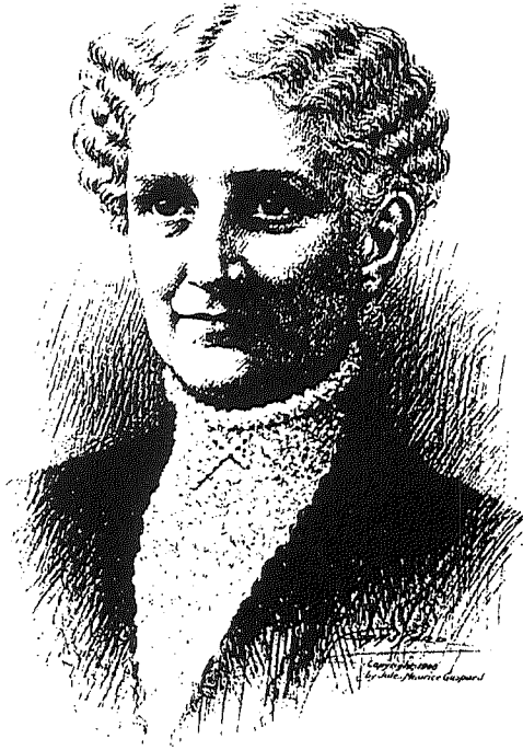
Mary Baker Eddy

The frontispiece in Science and Health as Mrs. Eddy left it in 1910 except that her name was written in her own handwriting, was her signature.