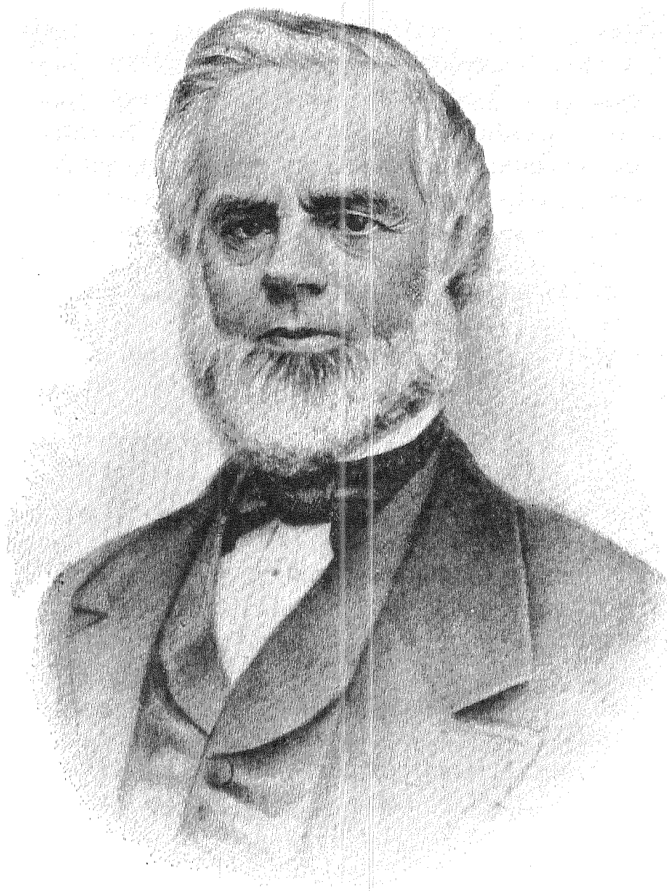
PHINEAS PARKHURST QUIMBY