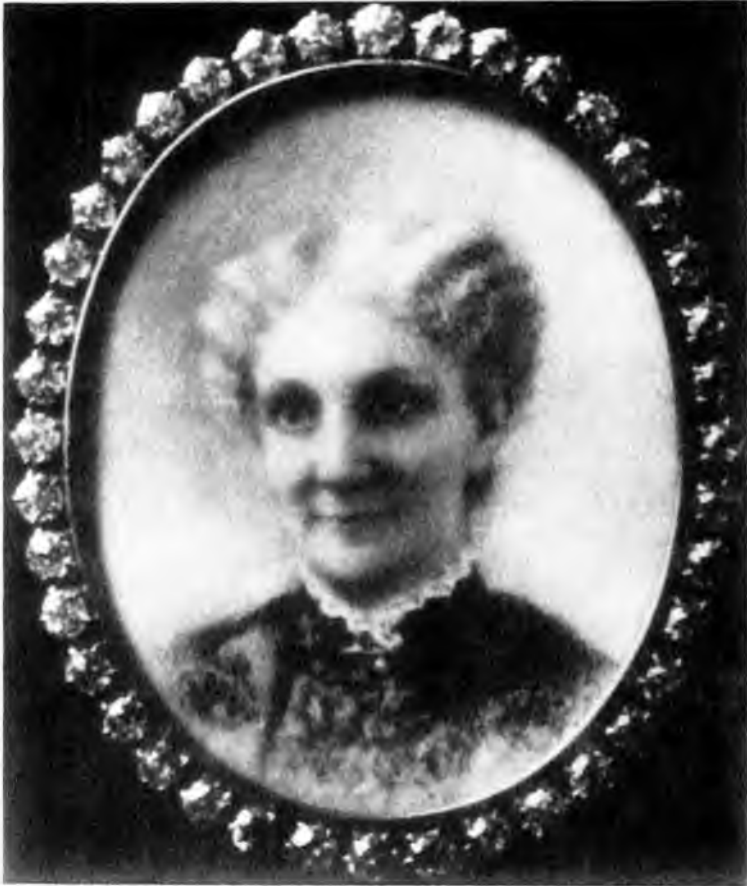
Mary Baker Eddy