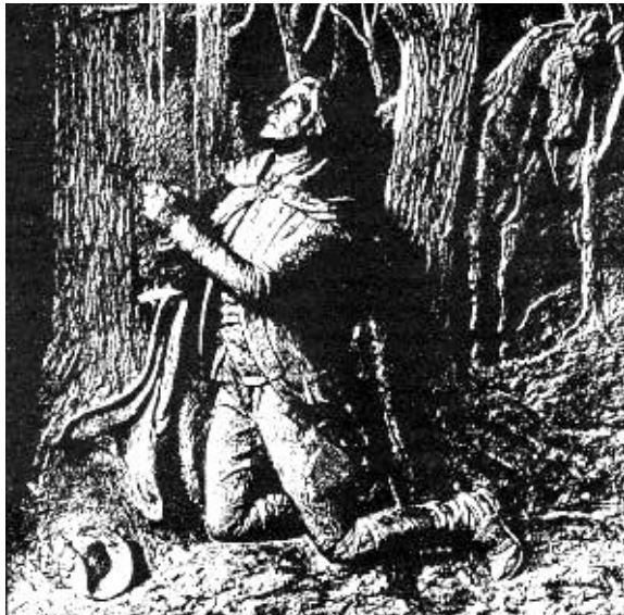
George Washington The Prayer at Valley Forge

Sharing the fate of his small ragged army, whose endurance and courage defied a king and built a nation, Washington kneels at prayer in the woods at Valley Forge.