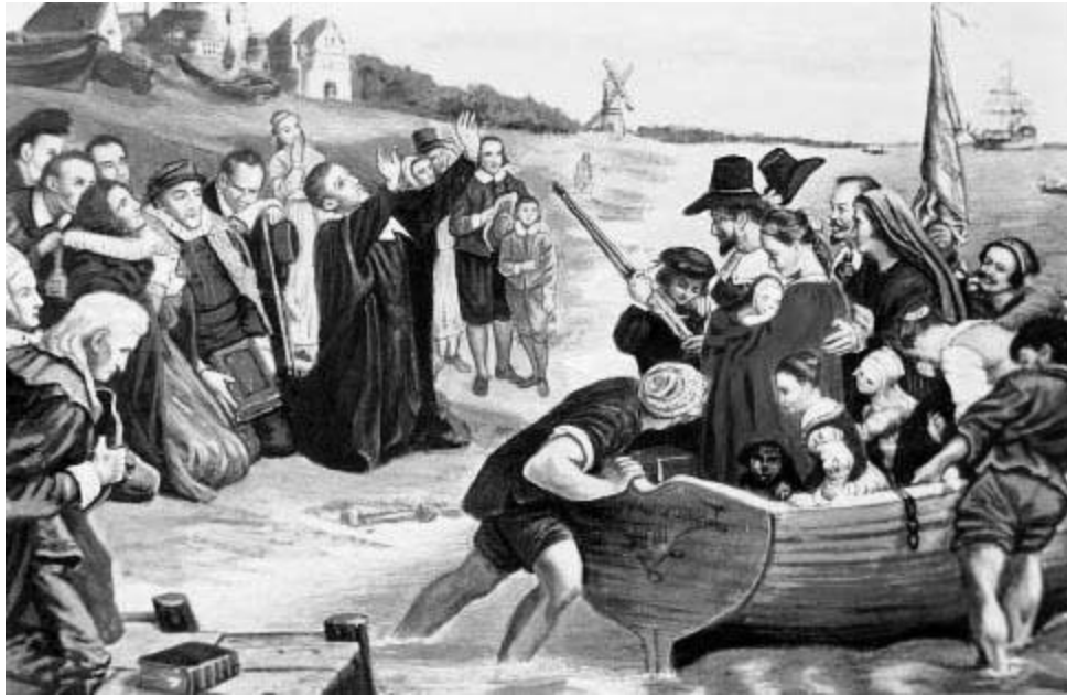
The Pilgrim's tearful departure from Holland