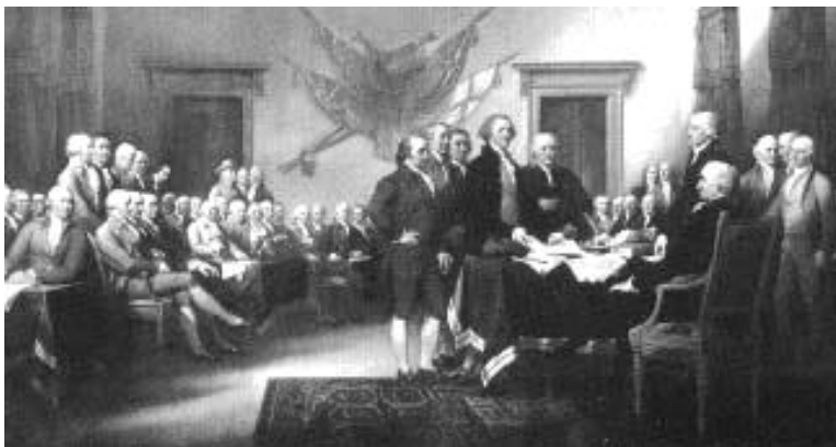
Signing the Declaration of Independence