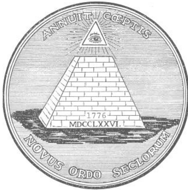
GREAT SEAL of the UNITED STATES of AMERICA

slowly, but it stands and is the miracle of the hour, though it may seem to the age like the great pyramid of Egypt, a miracle in stone. (Hea. 11:6)