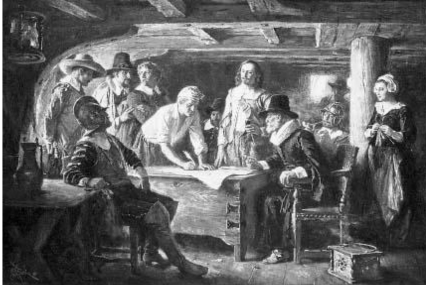
Signing of the Mayflower Compact, 1620

Artist: Percy Moran