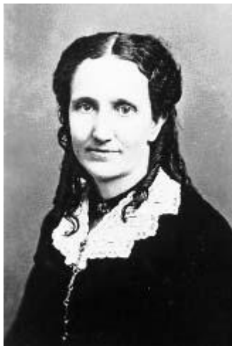
Mrs. Eddy about 1871, when teaching her first classes in Lynn, Mass.

"The very circumstance which your suffering sense deems wrathful and afflictive, Love can make an angel entertained unawares" (S&H 574:27).