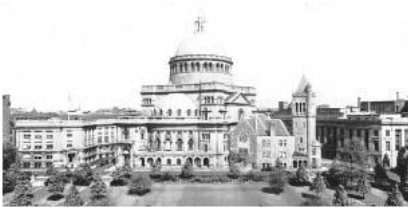
The Mother Church and the extension