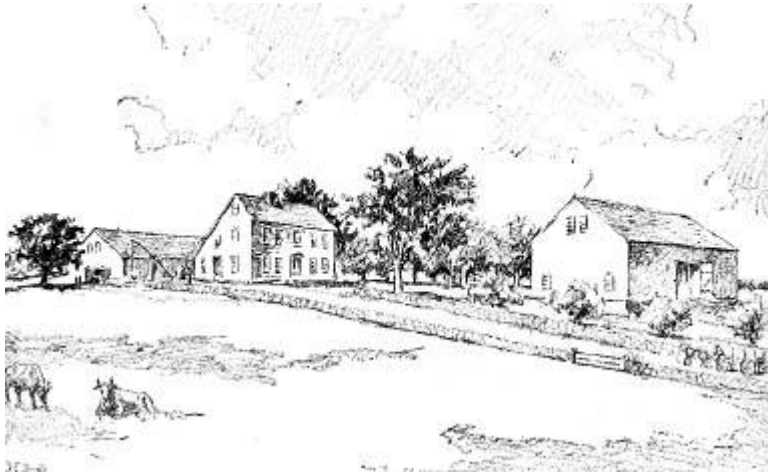
Mary Baker Eddy's childhood home in Bow, N.H.