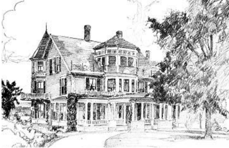
Mrs. Eddy's beloved "Pleasant View" in Concord, N.H.

Mary Baker Eddy once told a dear student that if she ever left Pleasant View it would be to be delivered up to her enemies, yet on January 26, 1908 she left Pleasant View. Why?