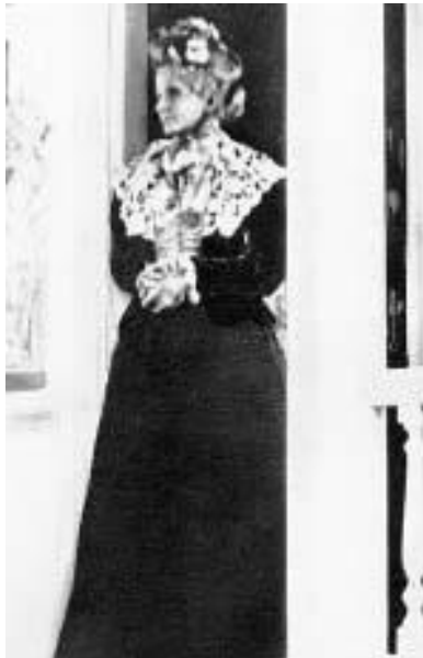
Mary Baker Eddy leaving on her drive from her home at Pleasant View.

Knowing this Mrs. Eddy wrote: "For the world to understand me in my true light and life, would do more for our Cause than aught else could. This I learn from the fact that the enemy tries harder to hide these two things from the world than to win any other points. Also Jesus' life and character in their first appearing were treated in like manner. And I regret to see that loyal students are not more awake to this great demand in their measures to meet the enemies' tactics."